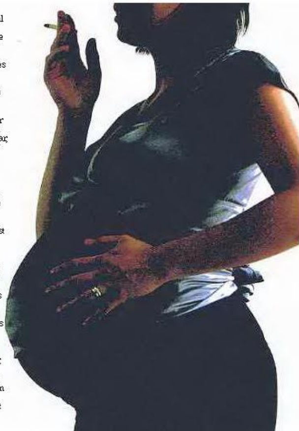
The Department of Health is hoping to reduce the number of women smoking while pregnant

It is also known that children who grow up with a smoking parent are more likely to smoke themselves.