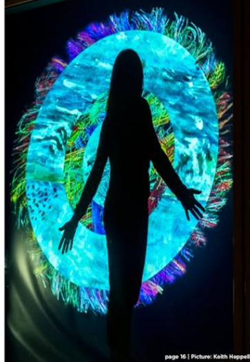
page 16